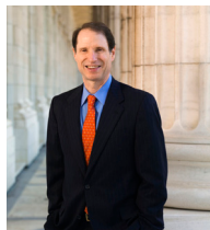
The Honorable Ron Wyden (D-OR) 2018