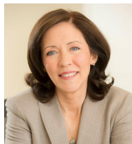
The Honorable Maria Cantwell (D-WA) 2018, 2010