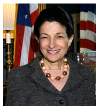
The Honorable Olympia Snowe (R-ME) 2012