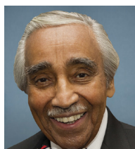
The Honorable Charles Rangel (D-NY-13) 2010