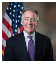
The Honorable Richard Neal (D-MA-1) 2019

For congressional leadership in championing affordable housing and the Housing Credit.