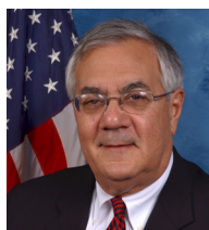
The Honorable Barney Frank (D-MA-4) 2012