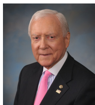
The Honorable Orrin Hatch (R-UT) 2018